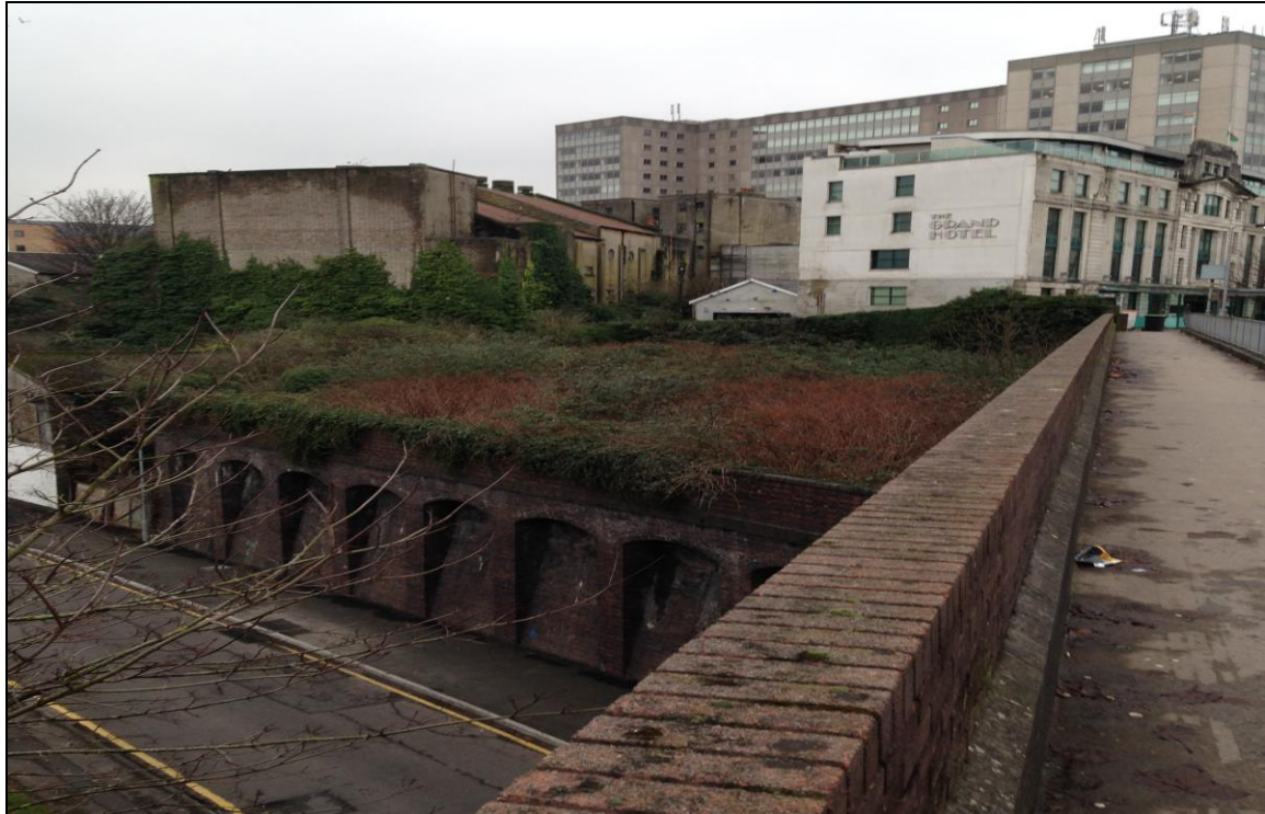
Photo 1 - View of site looking west.