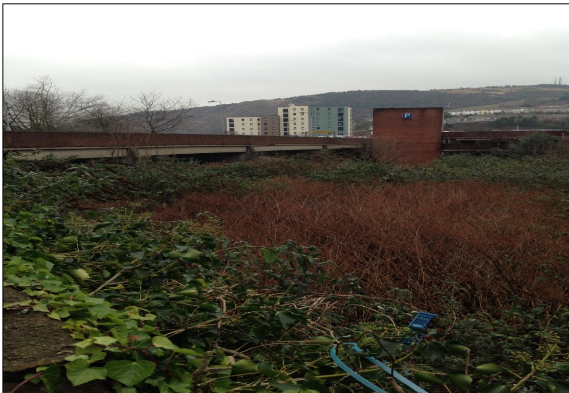
Photo 2 - View of site looking east.