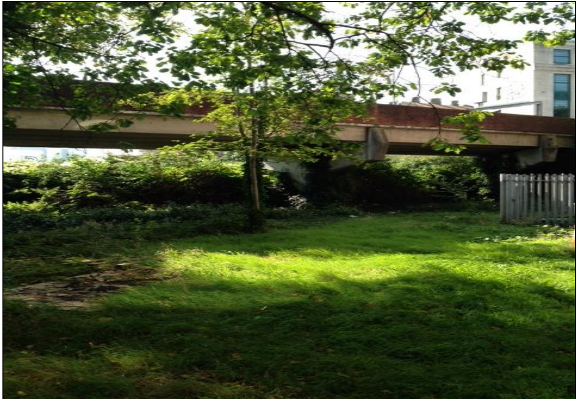
Photo 3 - View of site looking south from Network Rail land adjoining station building (site beyond over-bridge).