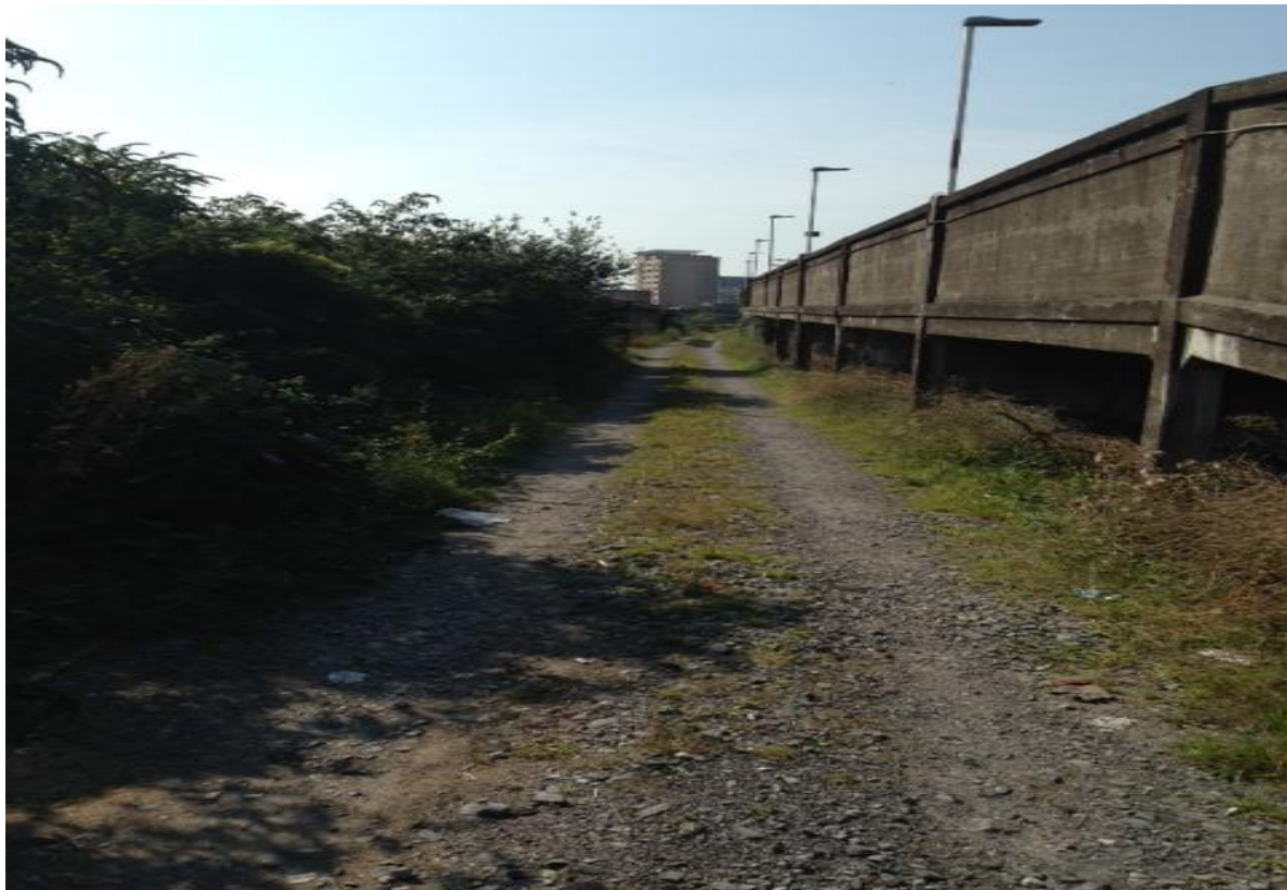
Photo 4 - Network Rail owned access to site.